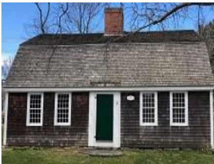
Above: The Cudworth House today.